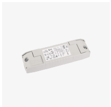
Driver ON-OFF EU 700mA 3,5-30W 200-240V Ref. 4.3063.1101