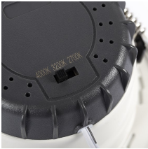
Adjustable temperature switch