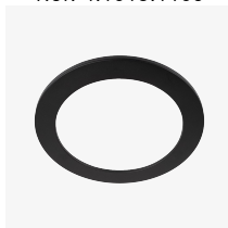
BOSTON 20 Frame Ref. 1.1146.8201