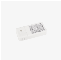
Driver DALI EU 250-700mA 20W 100-240V Ref. 4.3049.3102