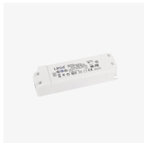
Driver ON-OFF 700mA 19-30W 100-240V Ref. 4.1013.1105