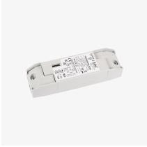
Driver DALI & PUSH EU 300-1050mA 3- 38W 240V Ref. 4.3069.6101